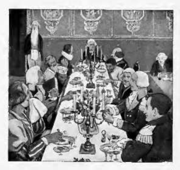
" THE BRILLIANT COMPANY WAS ARRANGED ABOUT THE BOARD "