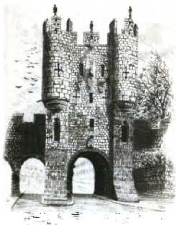
Micklegate Bar York