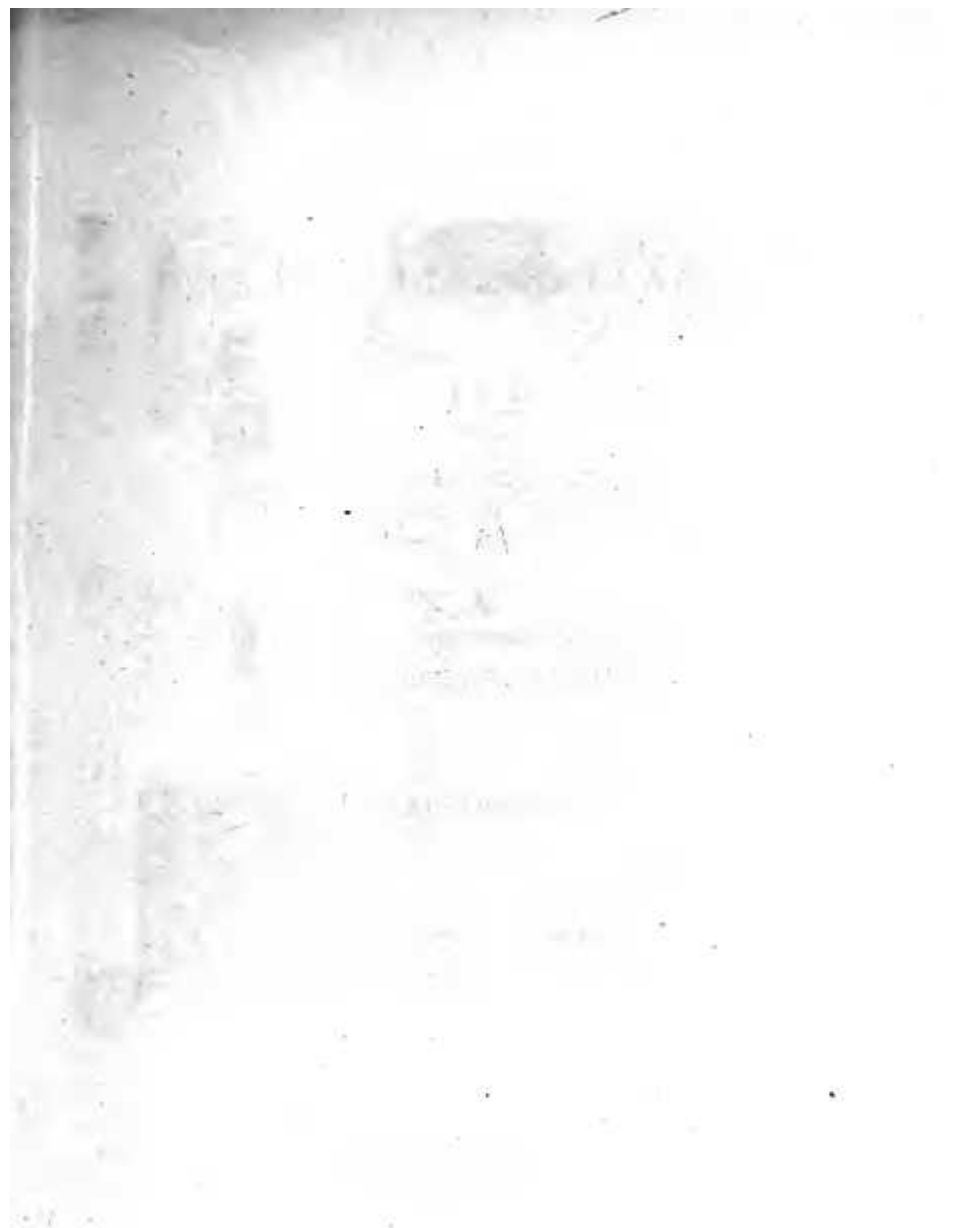
In the Sultan's Palace.