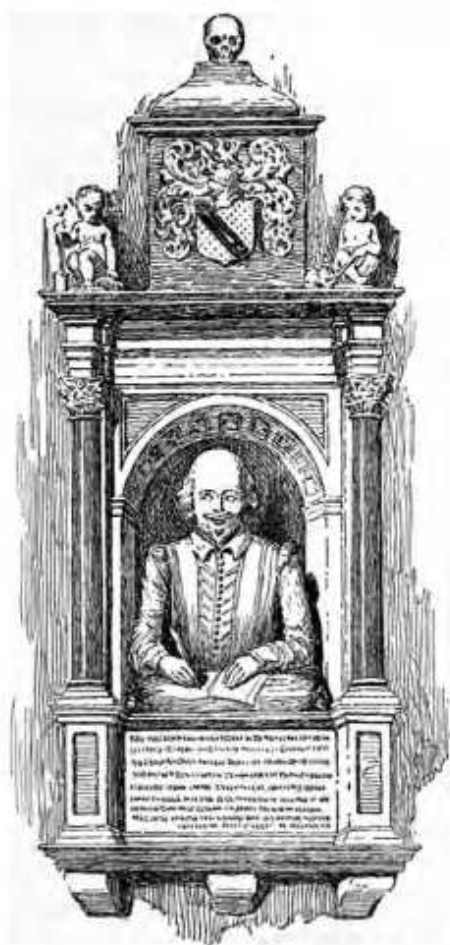
MONUMENT AT STRATFORD