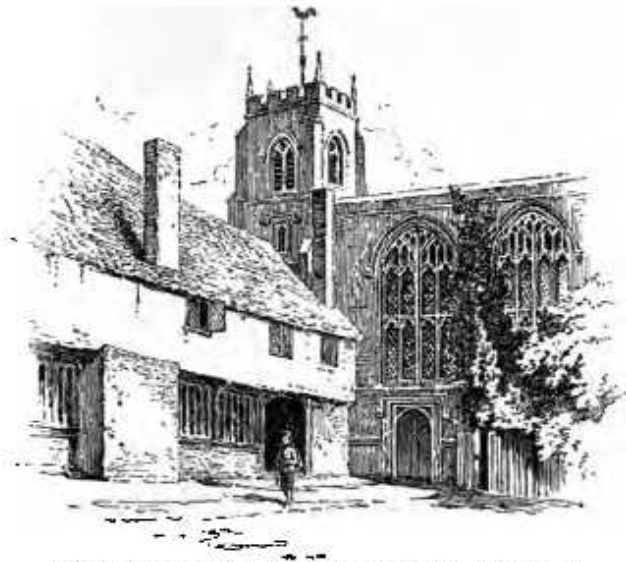
INNER COURT OF THE GRAMMAR SCHOOL, STRATFORD

his fellow-townsmen. After passing through the lower grades of office, he was elected alderman, and in 1568 became high bailiff or mayor.