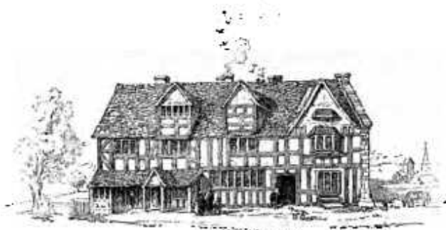
JOHN SHAKESPEARE'S HOUSE IN HENLEY STREET