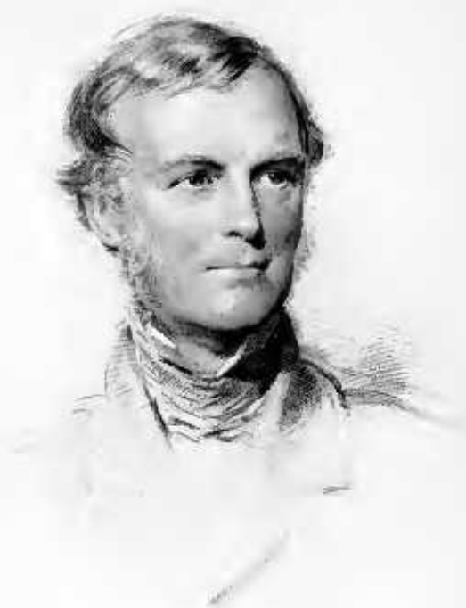
Sir George Grey. From a drawing by G. Richmond, R. A. 1859.