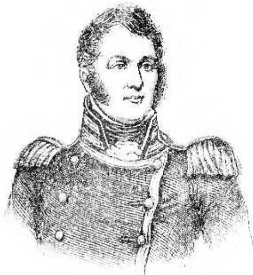
COMMODORE O. H. PERRY

Five of the fine American vessels which were captured by the British on lakes Erie and Huron in July and August, 1812, were owned at Black Rock;