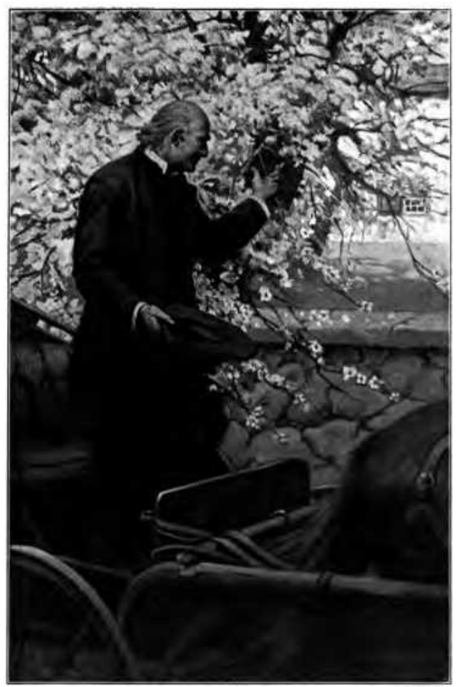
[See p. 7] DR. LAVENDAR'S SAGGING OLD BUGGY PULLED UP AT THEIR GATE