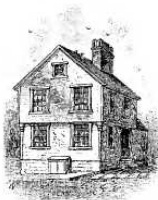
Birthplace of Benjamin Franklin