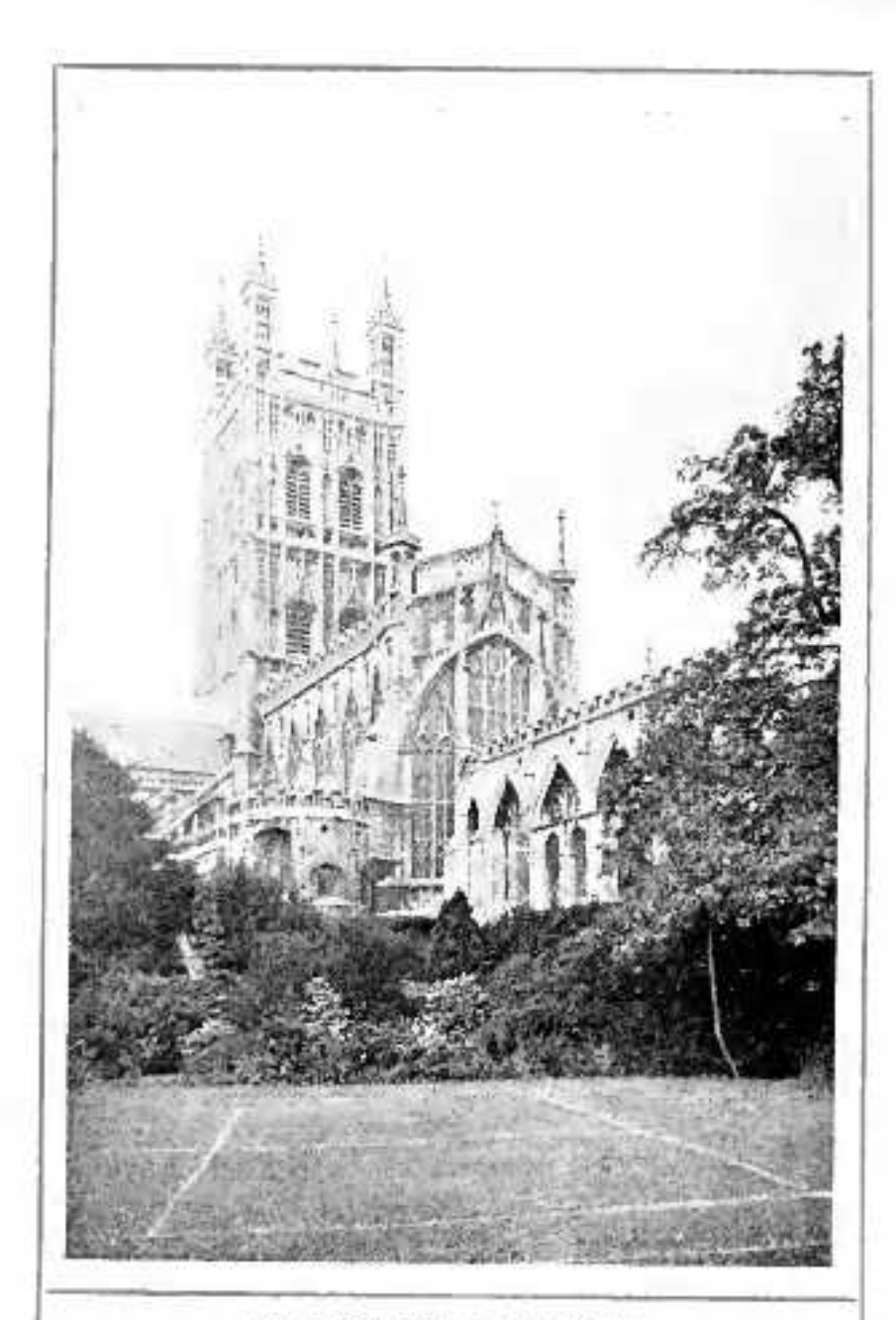
GLOUCESTER CATHEDRAL