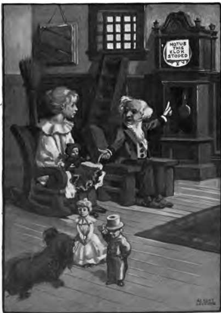
"Simple enough; I've stopped the clock," he said.—Page 132.— Frontispiece.