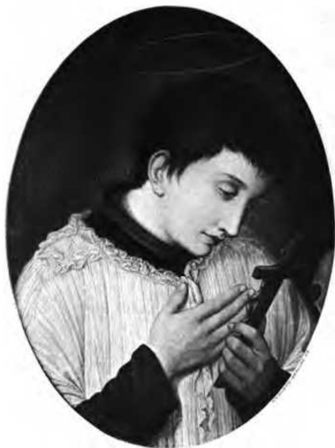
St. Aloysius Gonzaga.