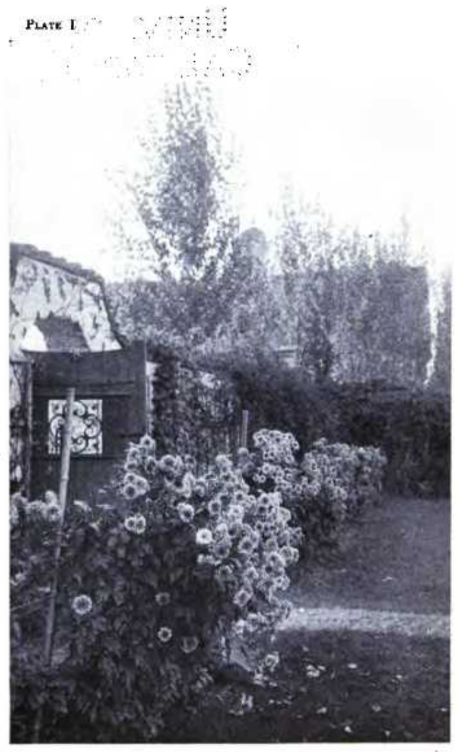
THE CHRYSANTHEMUM IS INDEED A GARDEN FLOWER

The greatest rewards and successes, in terms of results and true enjoyment with the least expense and trouble, are often achieved by the amateur who grows the hardy, many-flowered garden varieties