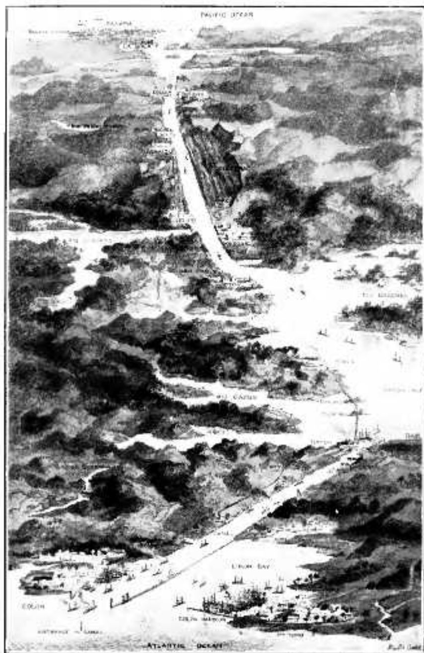
A bird's-eye view of the Panama Canal as it will appear when completed.