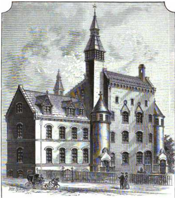
FLOWER SURGICAL HOSPITAL.