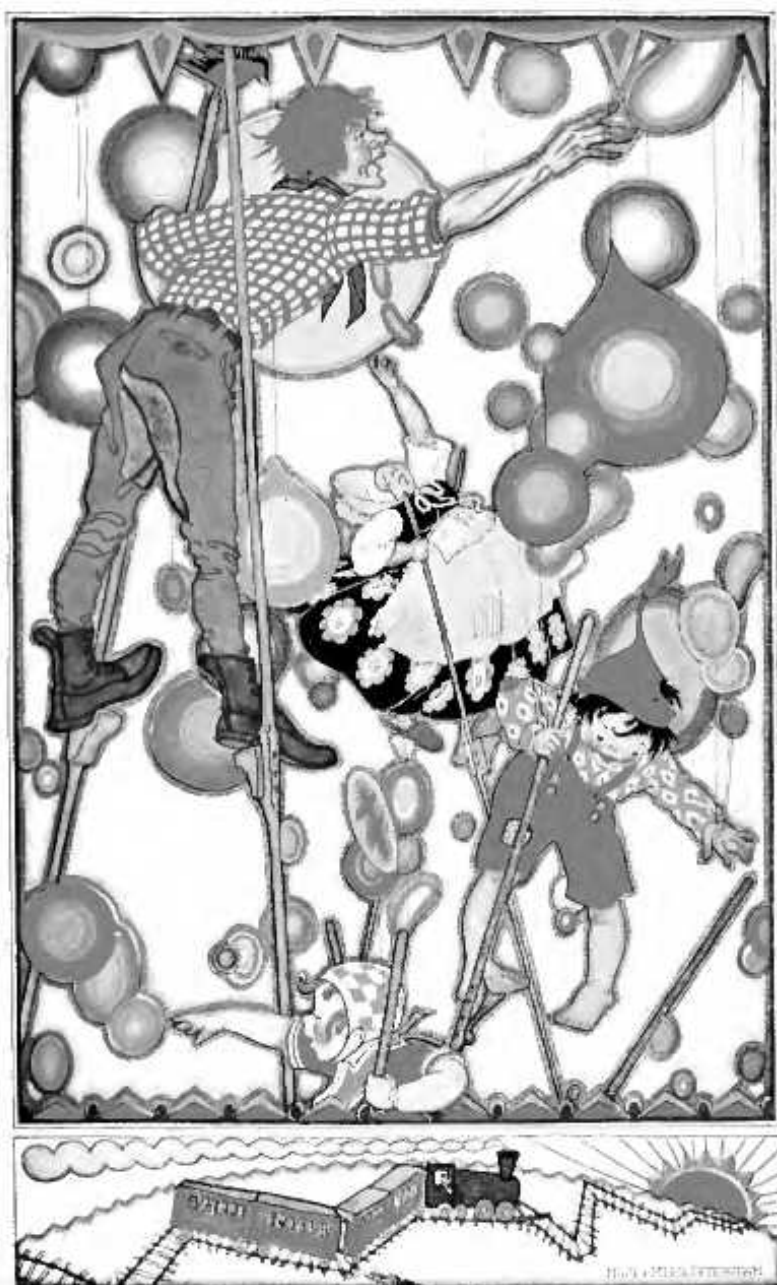
The balloons floated and filled the sky