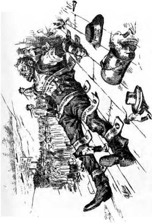
THE AMERICAN GULLIVER AND CHINESE LILLIPITIANS—SHALL THE LAST SPIKE BE DRIVEN? [From the Philadelphia North American.]