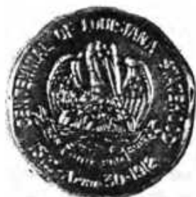
LOUISIANA CENTENNIAL MEDAL.