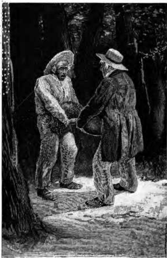
"JUDAS! YOU OLD COON!" — "MARS BEN!" (Page 72)