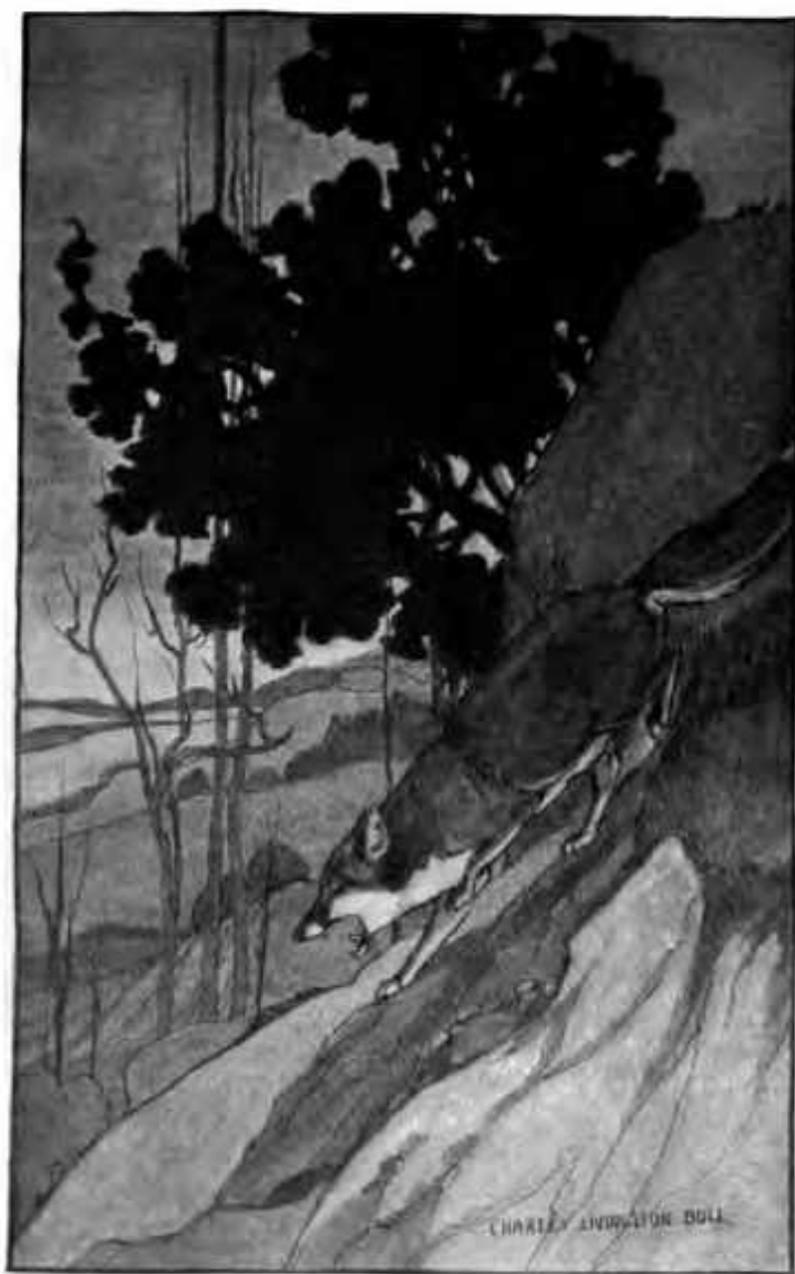
"The gray fox was leading bravely." Frontispiece. See page 16.