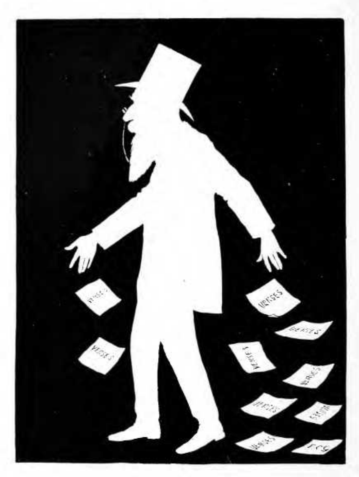
The Lobby Laurente