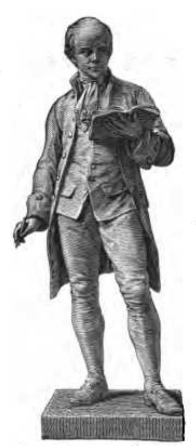
STATUS OF GOLDSMITH.