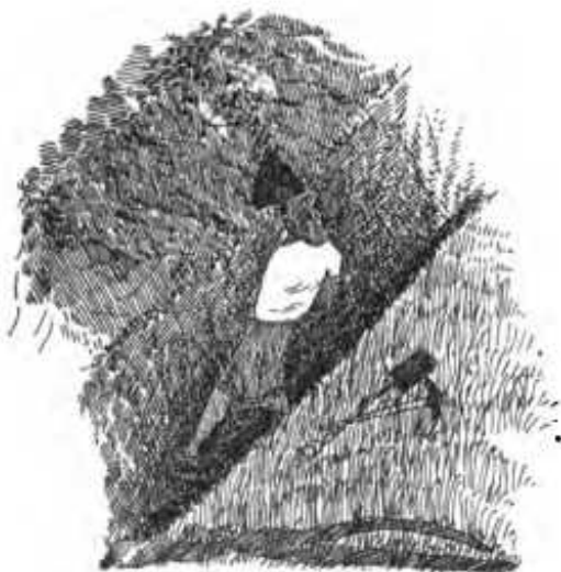
Digging Ye First Corral Ditch.