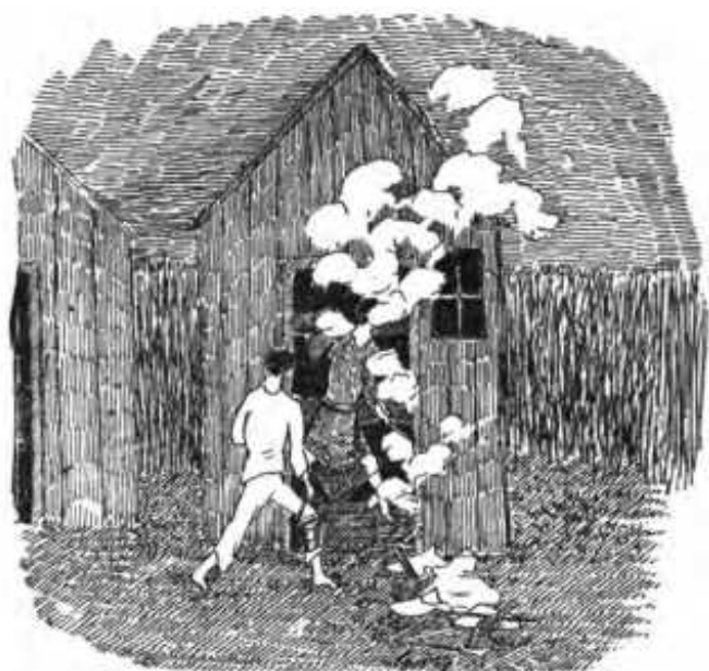
A "Prairie" Fire.