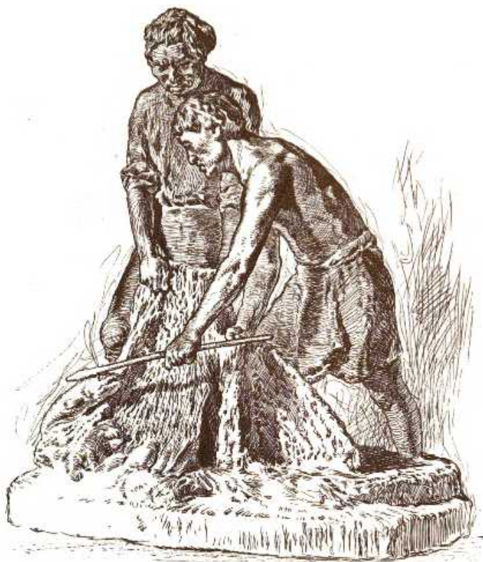
The Salmon Fishers