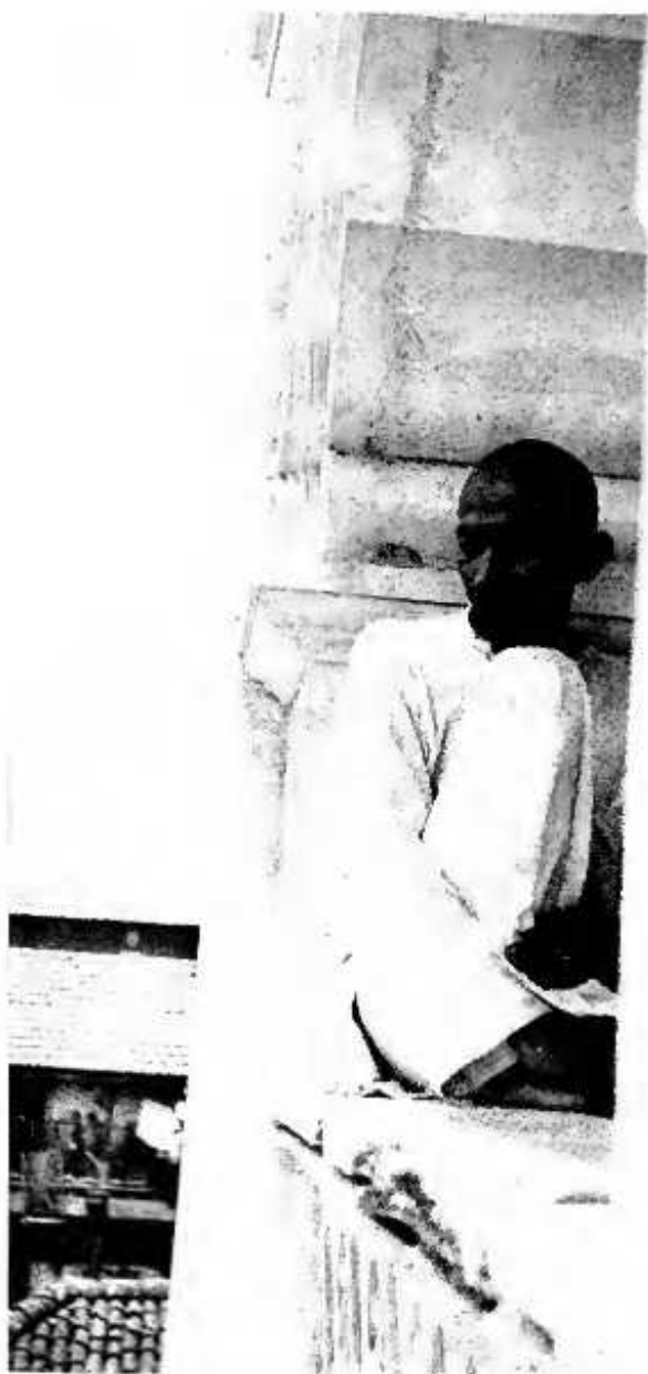
MABATMA GANDHI Watching the World Go By