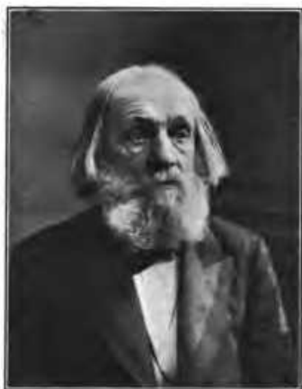
EDWARD EVERETT HALE