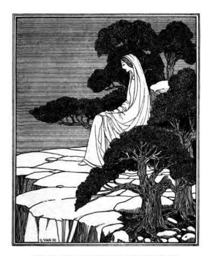
"TO BE ALONE, TO WATCH THE DUSK AND WEEP"