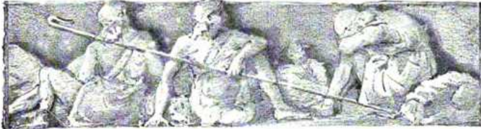
"WHILE SHEPHERDS WATCHED THEIR FLOCKS BY NIGHT."