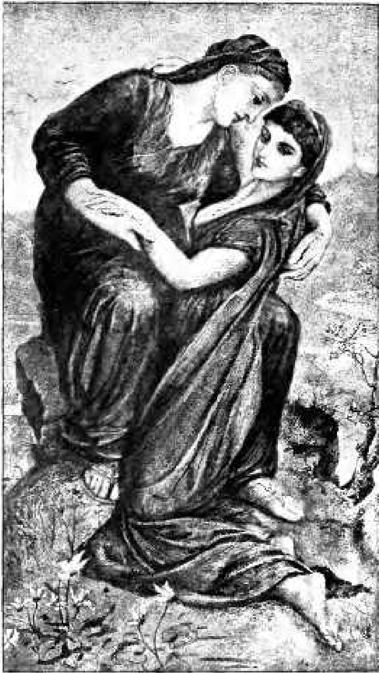
Demeter auf Persephone.