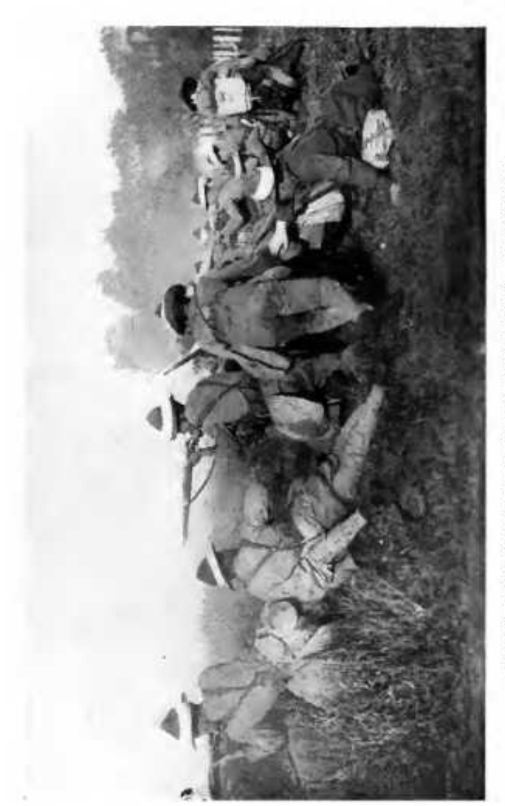
MILITIA MANETVERS TAKE ON THE ASPECT OF REAL WAR AT TIMES