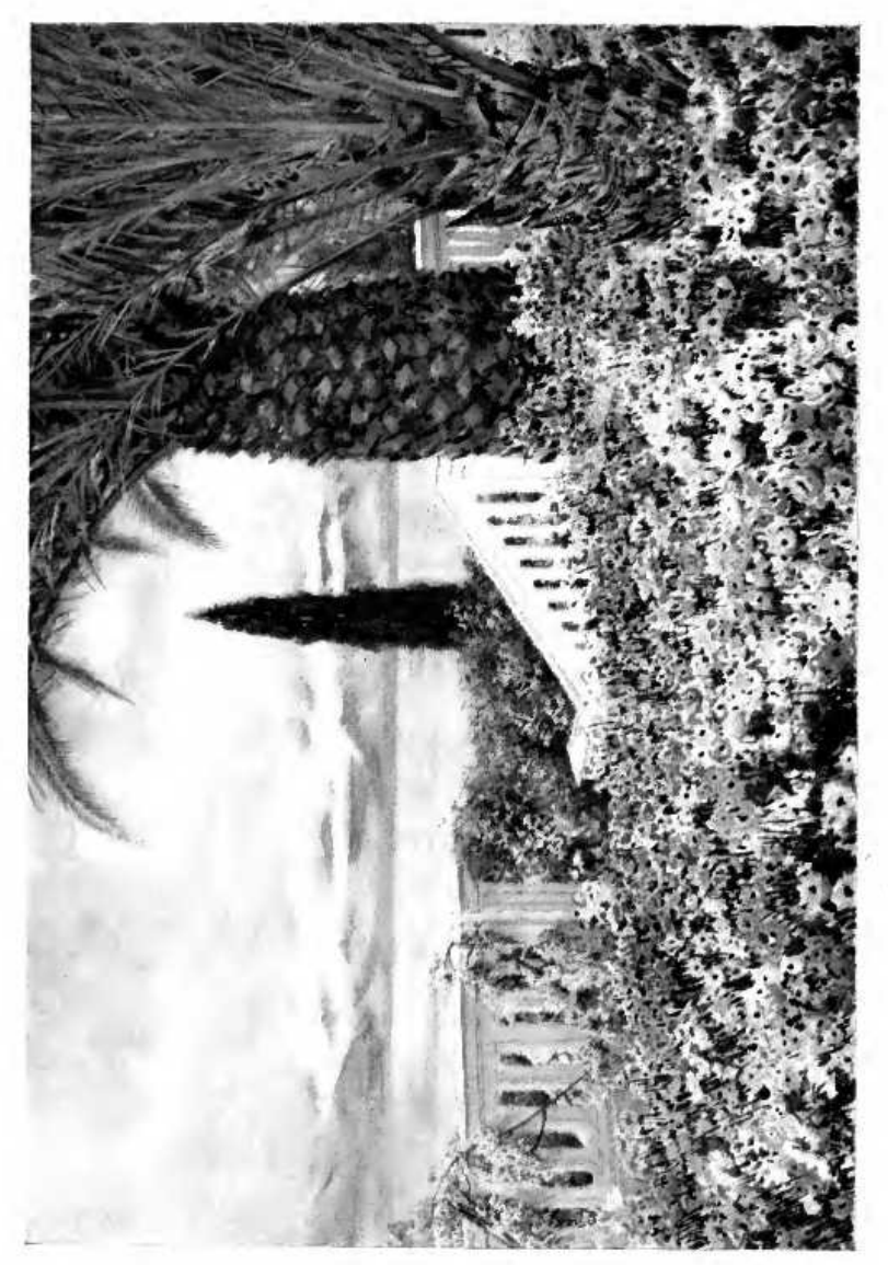
OVER THE STRAITS FROM THE ACHILLEION,