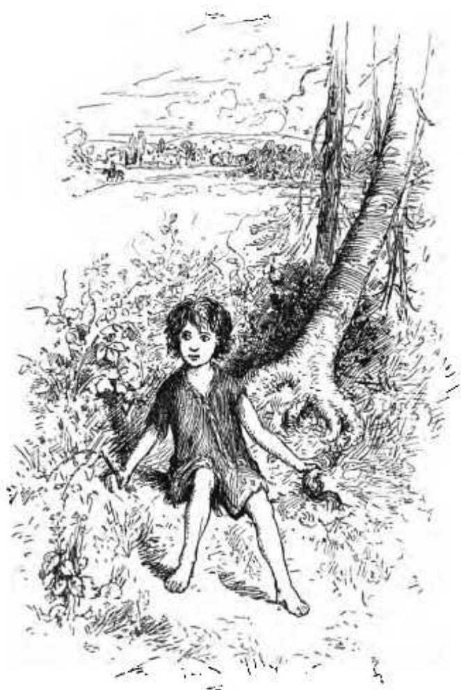
'I be a-waiting for my horsu.'—Page 8.