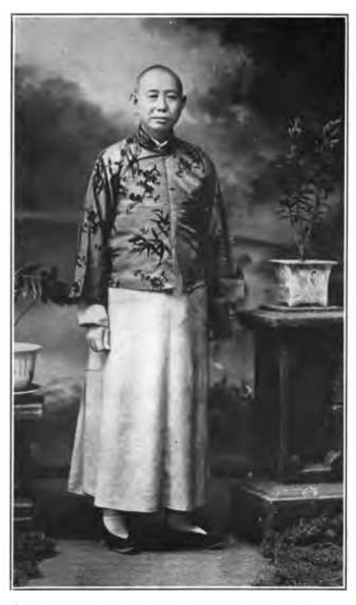
A member of an influential opticial family, who declined a high opticial position to help Christianity in South China.