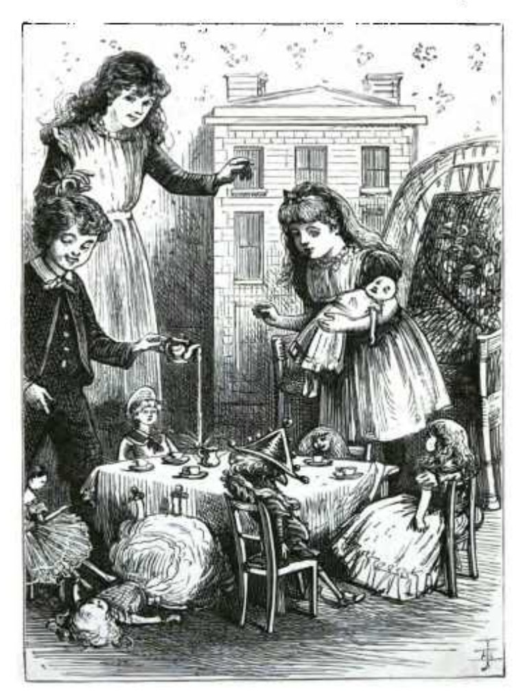
THE DULLS TRA PARTY.