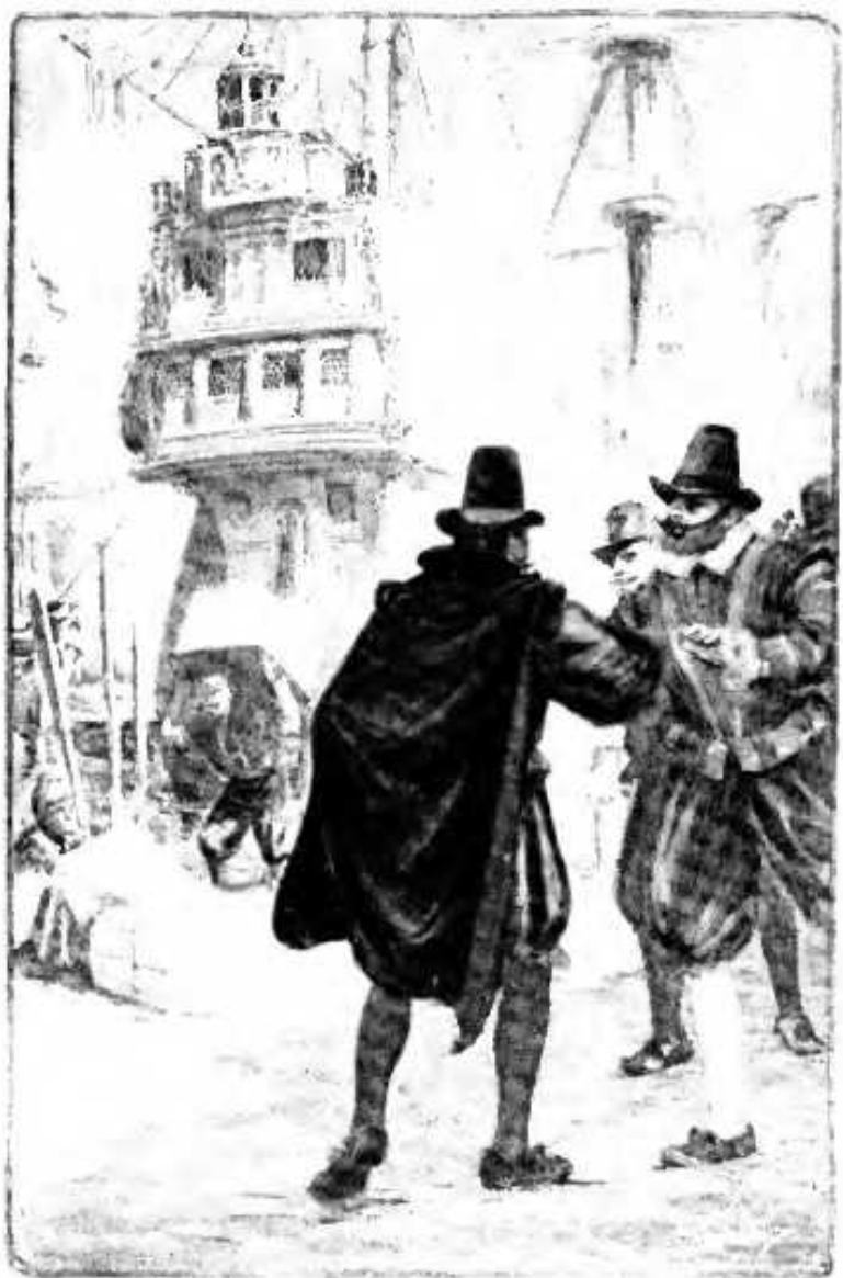
"THE MEETING OF SIR JOHN GILBERT AND RALEIGH" — Page 139