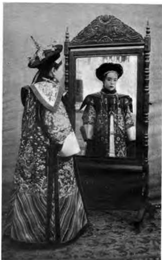
PRINCESS SU, WHOSE HUSBAND GAVE HIS PALACE FOR CHRISTIANS DURING BOXER SIEGE