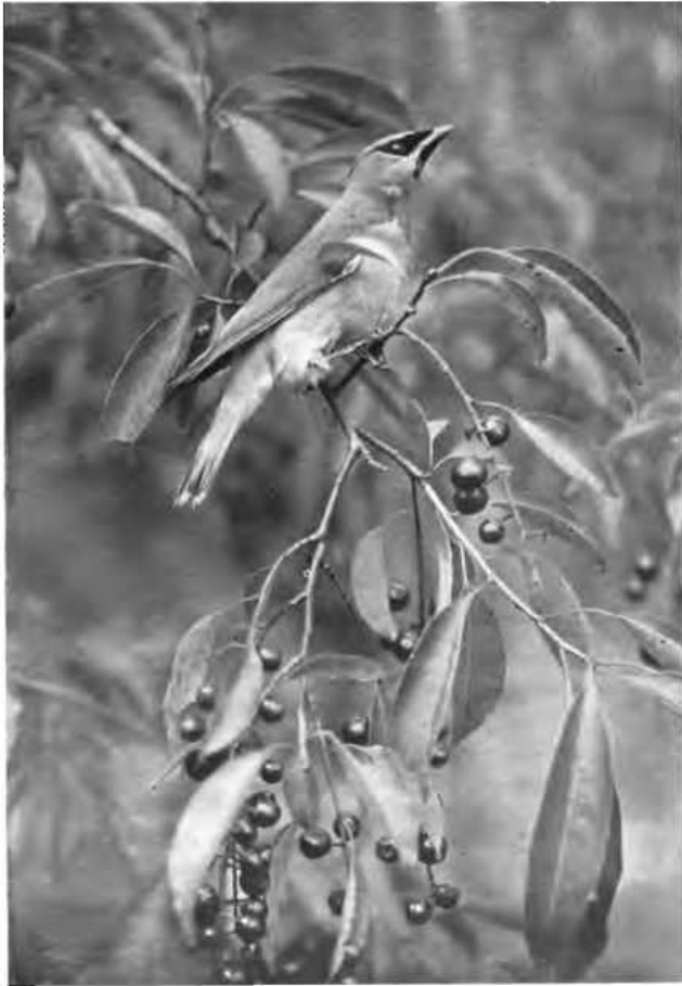
A cedar wax-wing in a choke-cherry tree. (Chapter 3)