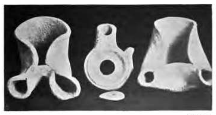
[See \not h , 32- Carthaginian lamps, two of punic form and one greek