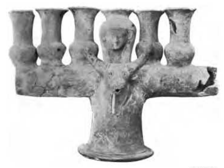
SEVEN-BRANCHED LAMP (Doubles)