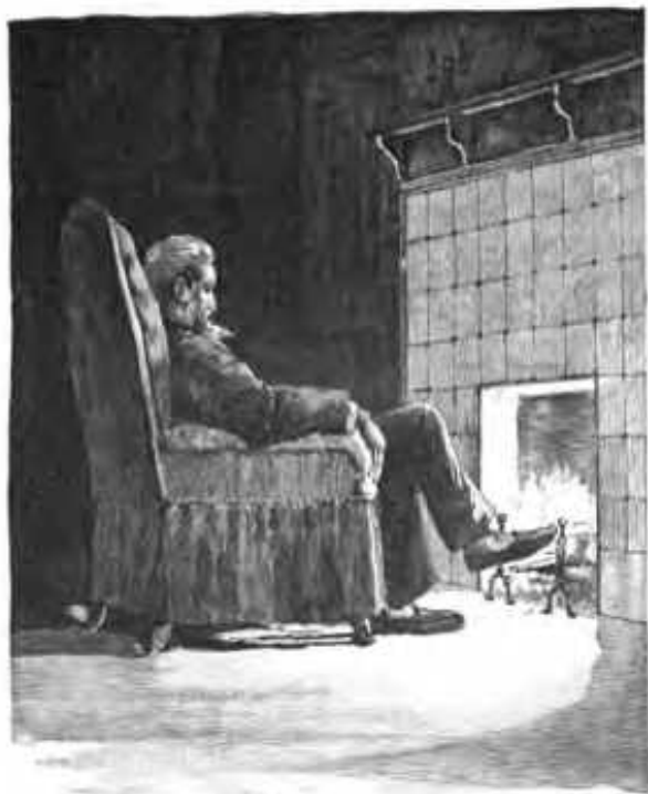
"My fire is my friend." — Page 27.