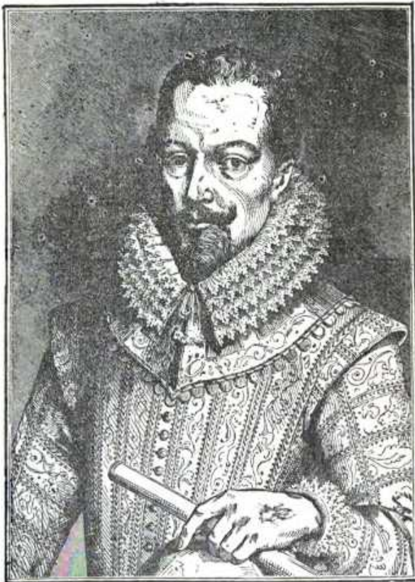
Raleigh, Explorer of Guiana.