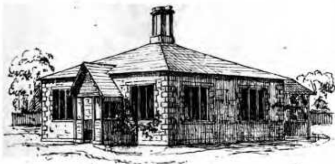
SINGLE 6 ROOMED COTTAGE. TO COST £40.