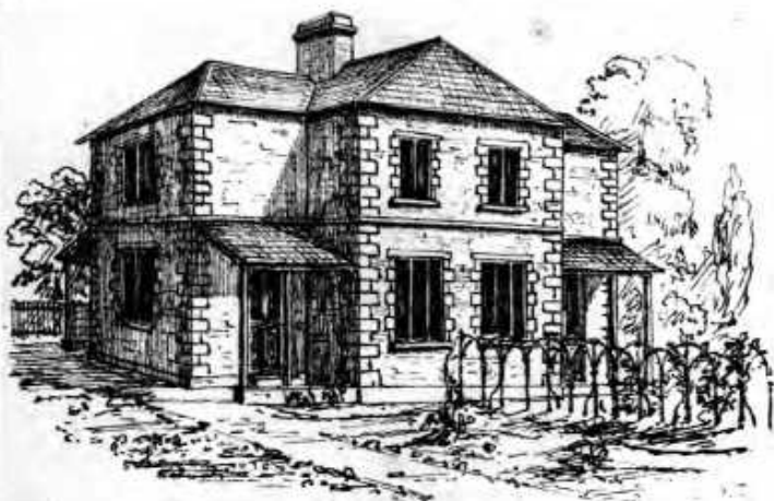
DOUBLE 6 ROOMED COTTAGE. TO COST £80.