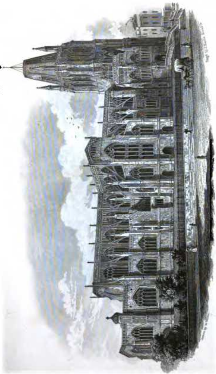
REDCLIFFE CHURCH, BRISTOL.