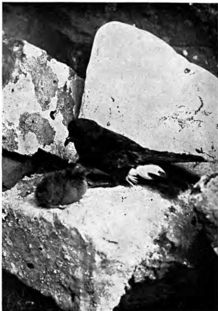
STORM PETREL AND NEWLY-HATCHED YOUNG.

Note the large raised opening of the nostril,