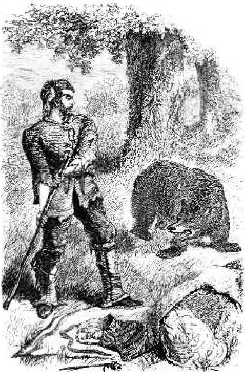
ABOUT A MAN AND A BEAR.—See PAGE 32.