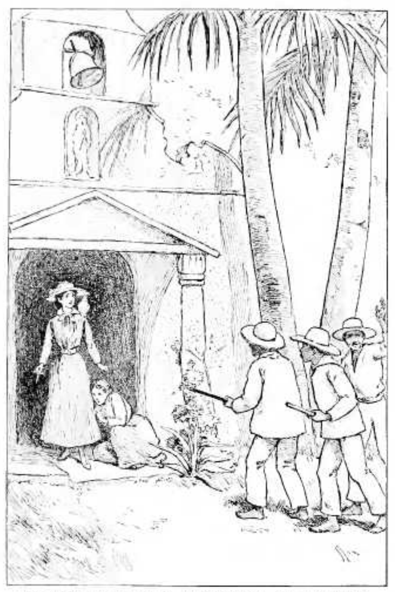
BRITA MONTFORT DREW HER DAGGER AND WAITED."