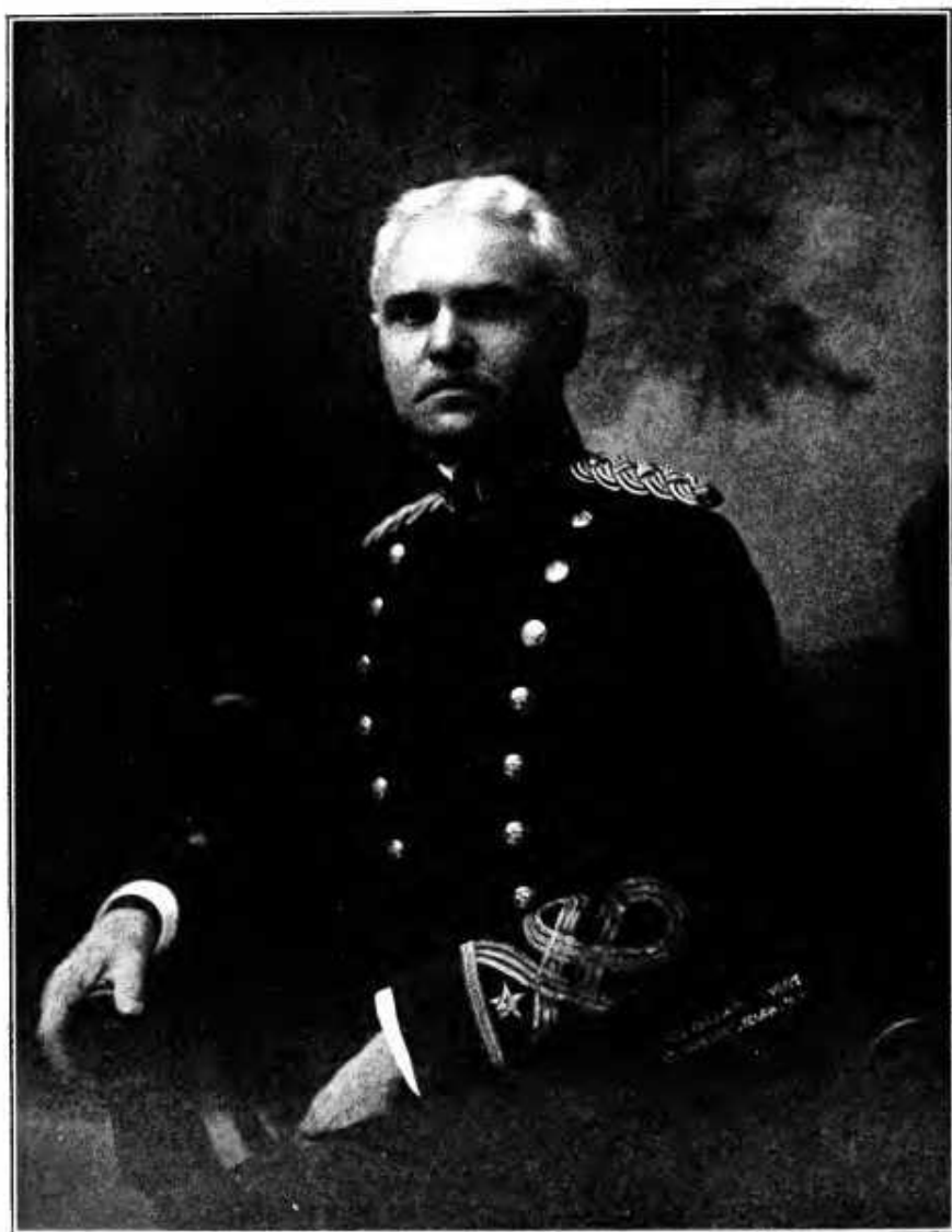
COL. GEORGE W. GOETHALS, U. S. Army, Chief Engineer who is in charge of the Panama Canal Work.