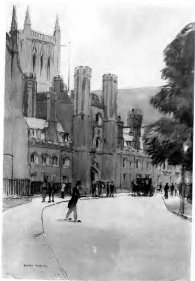
ST. JOHN'S GREAT GATE.