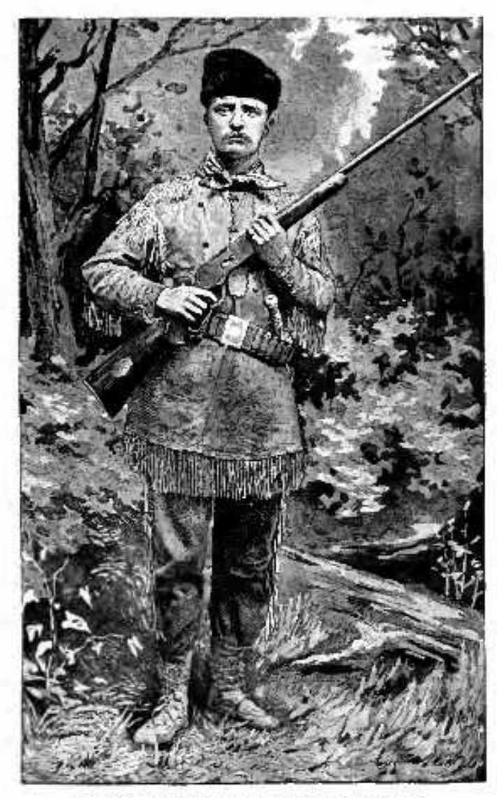
THEODORE ROOSEVELT IN HUNTING COSTUME.