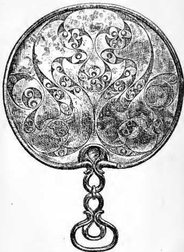
Engraved bronze mirror-back, Late Keltic. Found at Desborough, Northants [1].