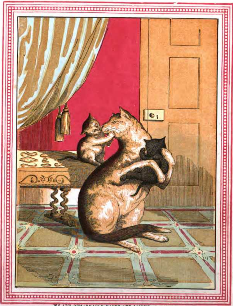
WE ARE REMARKABLY HAPPY AND LOVING.—Page 11.