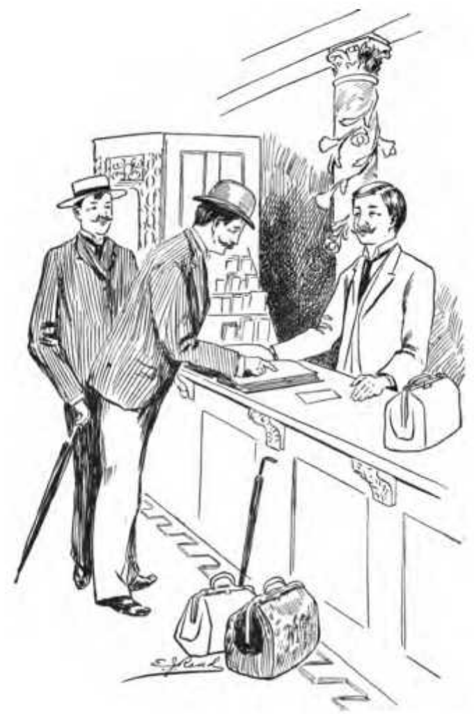
""SPECIAL GUESTS OF THE PROPRIETOR." NO CHARGES" Another Kind of Man. Page 57.